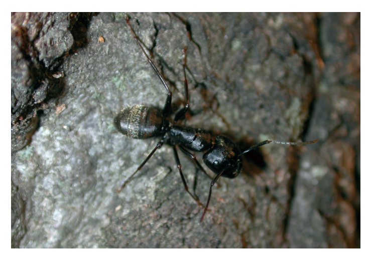
Figure 1. Black carpenter ants ( \approx 3/8 up to \approx 5/8 inch) are dull black and their abdomens are covered with fine, yellowish hairs. They are most common inland in central and northern Georgia.

between nest sites and feeding sites on semi-permanent paths that the ants construct and maintain (Figure 3). In the evening, ants can be seen using these paths as they emerge from and return to their nest.