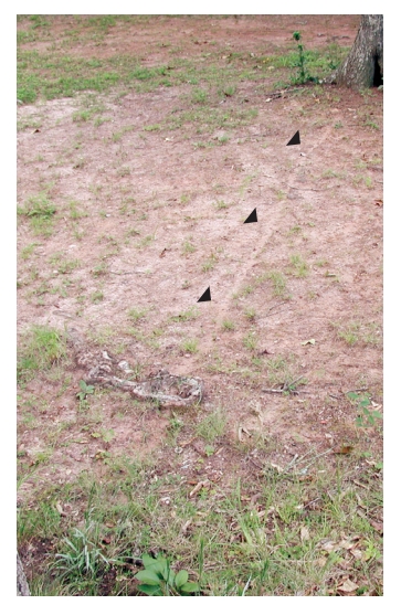
Figure 3. Carpenter ants construct and use semi-permanent paths as they move between nest sites and feeding sites, and will even use the same path from one year to the next.

property owner. Regardless of the company hired, the technician should conduct a thorough and complete inspection that results in location of the nest, or at least a probable nest site, before treatment. Although locating the nest is not always easy, it is the key to eliminating the carpenter ant infestation.