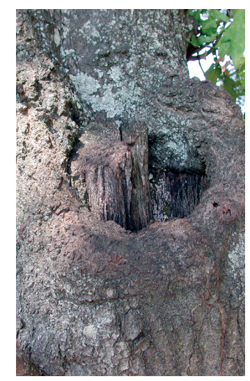
Figure 4. Outdoors, a common nest site of carpenter ants is in hardwood trees containing a knothole or treehole where ants find an environment that is ecologically stable and protected from adverse environmental conditions.

Figure 3. Carpenter ants construct and use semi-permanent paths as they move between nest sites and feeding sites, and will even use the same path from one year to the next.