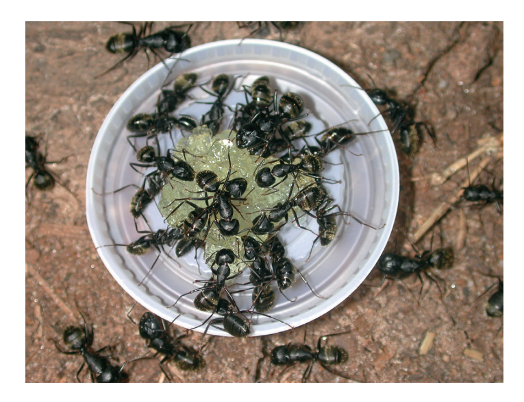
Figure 5. Provide carpenter ants gel bait when attempting to control them outside the home. Baits should be placed, preferably in the evening or at night, where ants can find and eat it—e.g., next to or on trees where they are nesting or directly on their path.